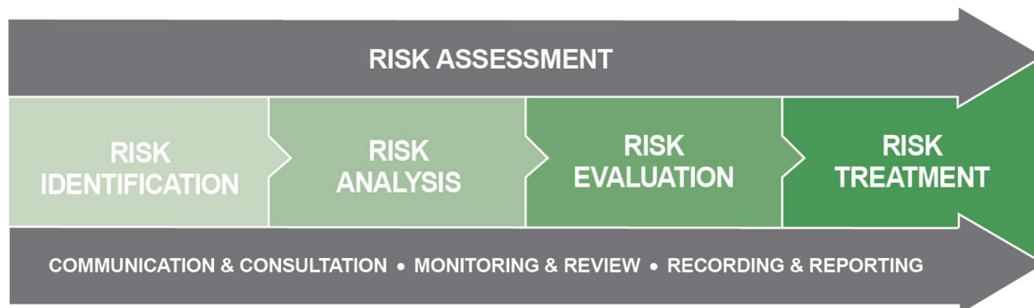
Figure 1: Overview of the risk assessment process

The Australia/New Zealand Standard AS/NZS 31000: 2018 Risk Management was used to guide the bush fire risk assessment process. This is outlined in Figure 1 below.